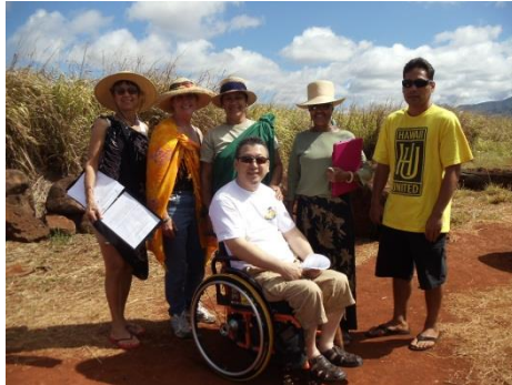
... against the odds, this visitor completed his journey...