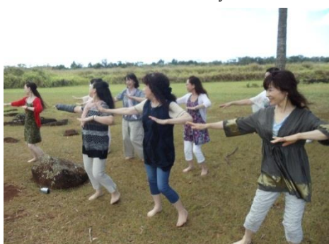
6.23.12 A Hula Hālau from Japan present their hula "Leinani" as their makana to Kūkaniloko....