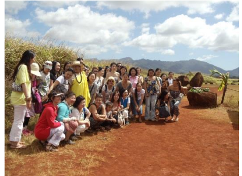
6.24.12 another Japanese Hālau of 38 haumana