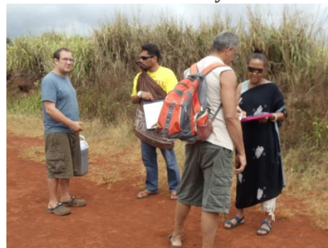
6.16.12 HCCW surveyors are Nā mea ana 'āina...