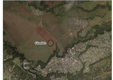
0 100 200 300 400 500 feet