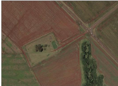
0 100 200 300 400 500 feet

June 27 th , Wednesday... Garcia and Associates, an Environmental Consulting Service, was onsite at Kūkaniloko. A technique called photogrammetry is used to extract digital data from photos. Samples of aerial photos of Kūkaniloko on the right and left were taken from higher perspectives. State-of-the-art ground penetrating radar equipment (below) was used to seek the unseen. Completed results are anticipated by our Wednesday August 8 th HCCW monthly meeting at 7pm