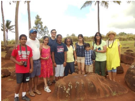
6.23.12 A Mililani Town 'Ohana & their relatives from New York watched their kaikamahine hula kahiko...