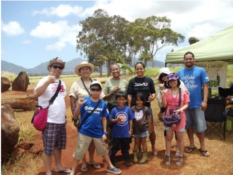
6.24.12 Nā mea ana 'āina with a few visitors...