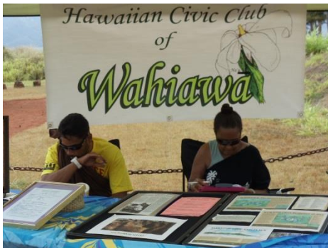
6.16.12 First weekend of the survey at Kūkaniloko