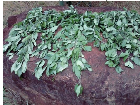
6.24.12 makana left at the entrance